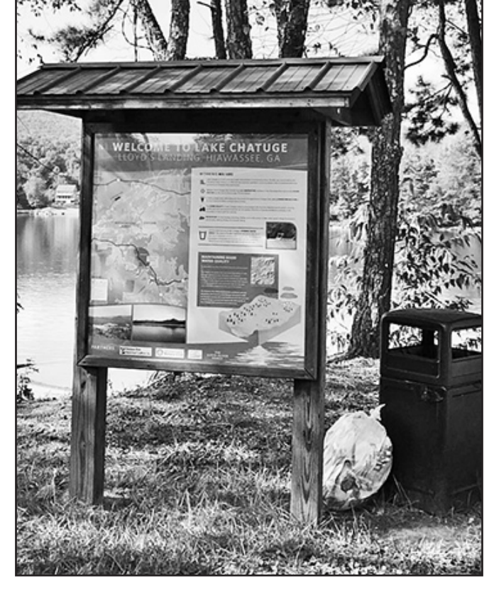
Household trash left at Lloyds Landing.

Lloyds Landing and Mayors Park are some of the most trash covered areas in town, especially with people leaving their household garbage for the city to pick up. Cook and Grader would rather be doing other projects for the city rather than picking up other people's trash, but a town strewn with litter does not at-